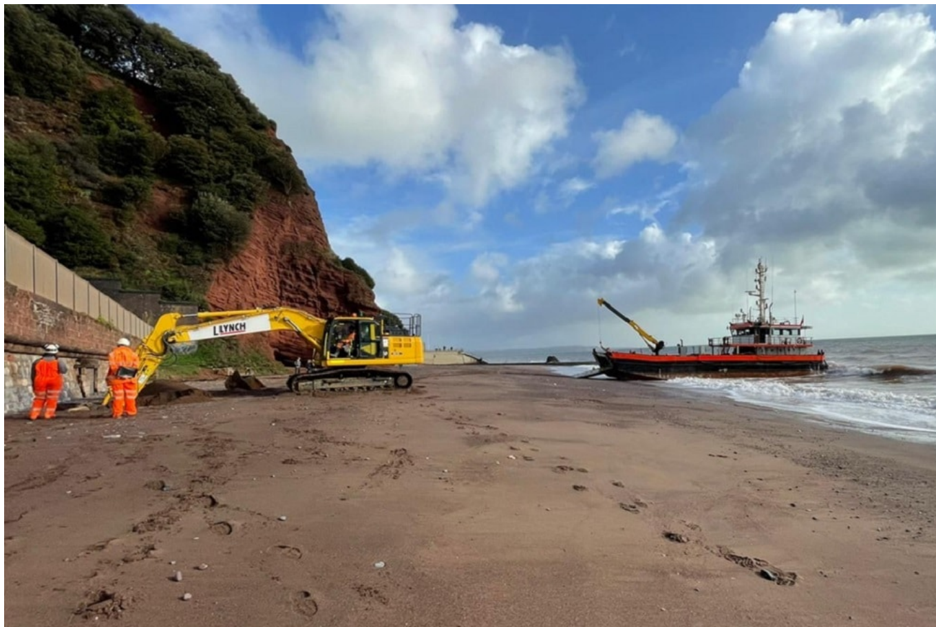
Ground investigations at Coryton Cove