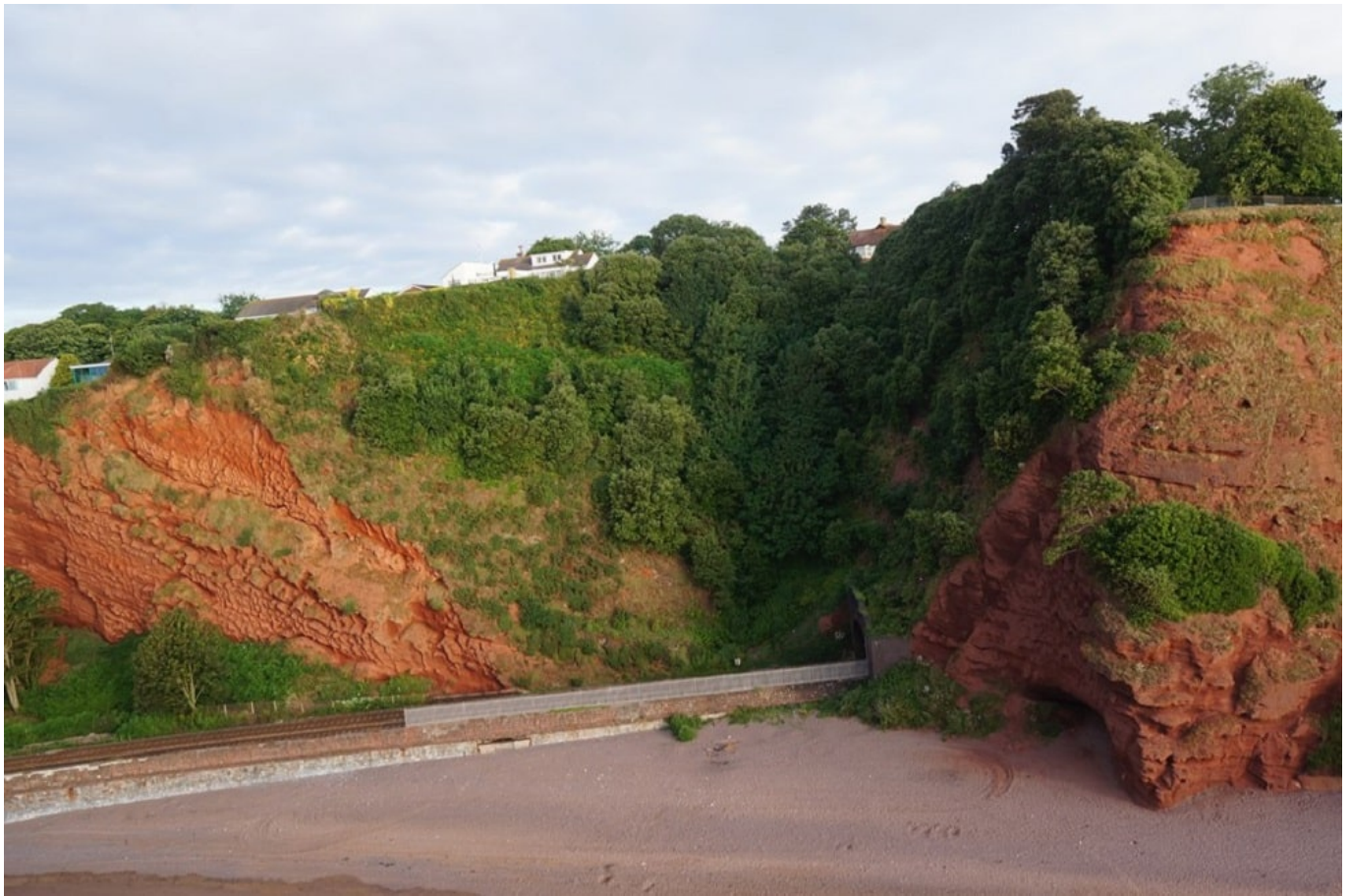
The cliffs above Kennaway Tunnel to Marine Parade in Dawlish

The resilience measures between Dawlish and Holcombe will include netting designed to retain the cliffs in some high-risk locations; and catch fences in others, which will stop any cliff material before it reaches the railway.