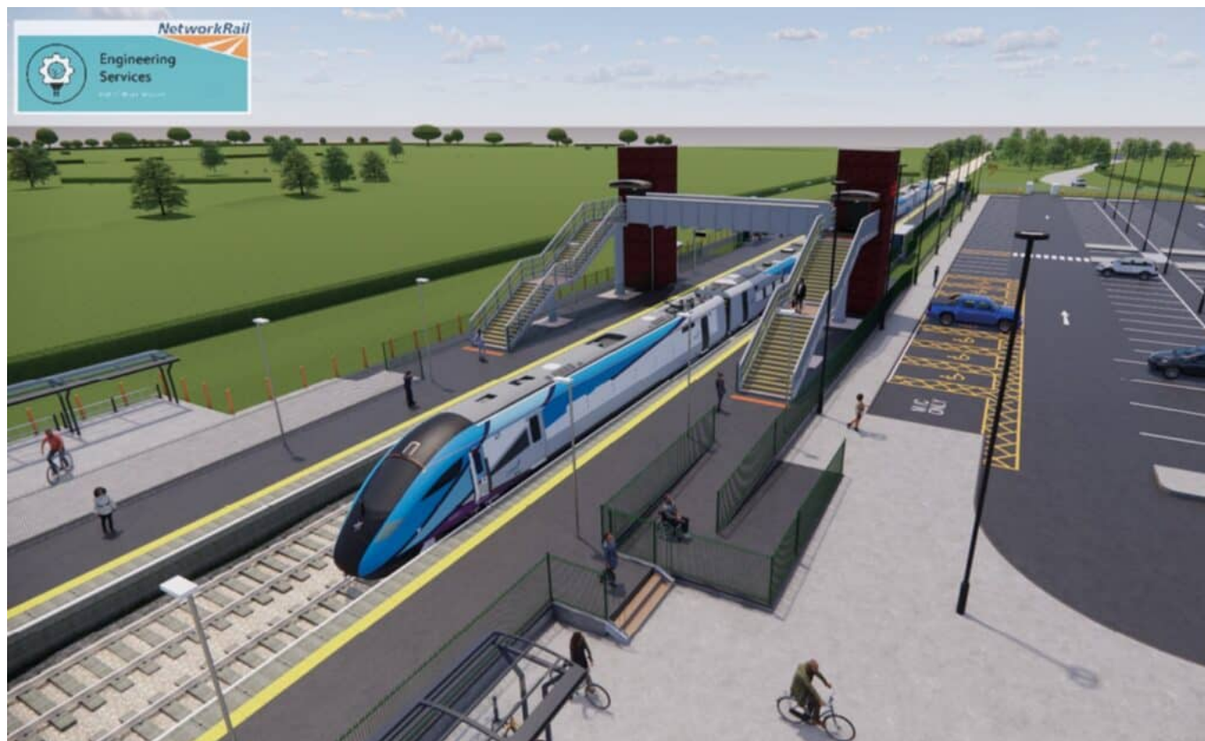
Proposed appearance of Haxby Station.

Just days after Prime Minister Rishi Sunak's visit to the proposed site, Network Rail , in partnership with City of York Council and the Department for Transport , has submitted a planning application to build a new, two platform railway station in the town.