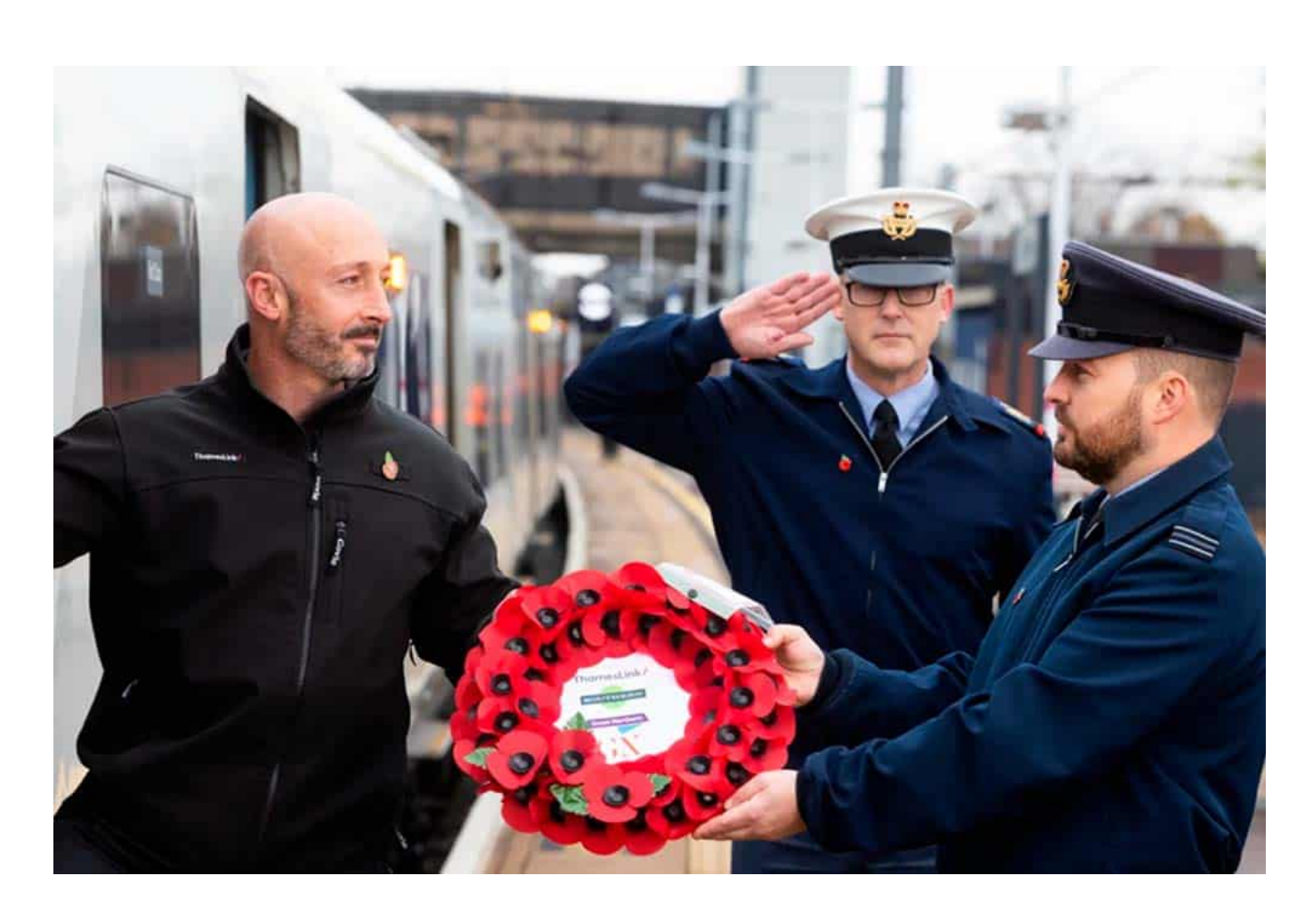
Thameslink invited officers from RAF Henlow to transport a wreath to London as part of 'Routes of Remembrance'