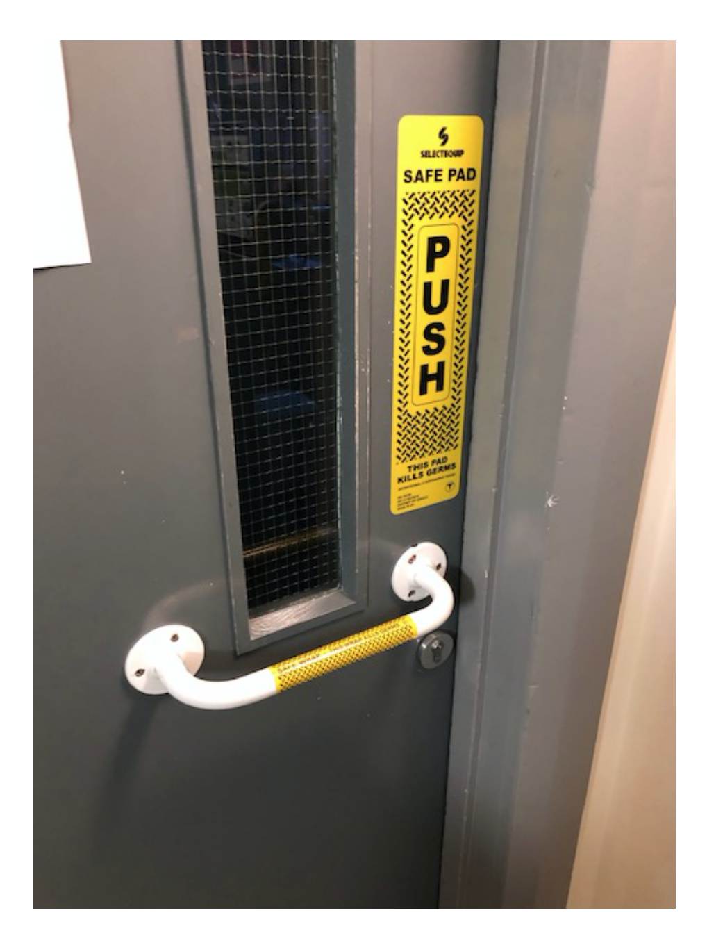
Veraco Safe Pad™ solutions in place to protect the team at Network Rail